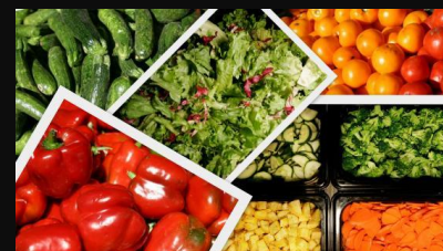
Vegetarian or Fasting?

All ELL students and their parents have the right to get satisfactory consultations from teachers, counselors, administrators and other school personnel. ELL students also have the right to complain to school authorities regarding issues that may affect his/her academic life.