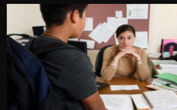
Speaking to Counselors

Schools should provide translation and interpretation services to those who need it. All ELL students have the right to receive respect from teachers, administrators and staff even though they speak